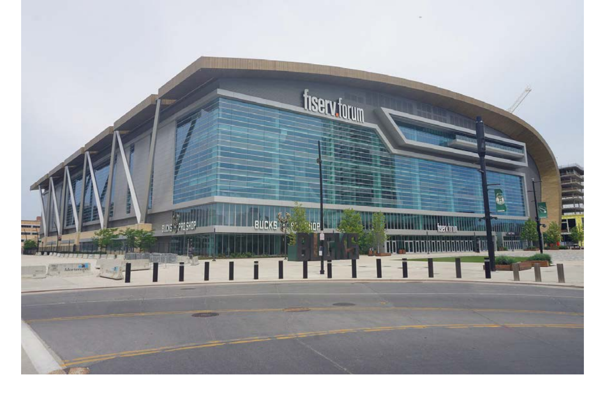
The Fiserv Forum in Milwaukee will host the Republican National Convention later this summer.